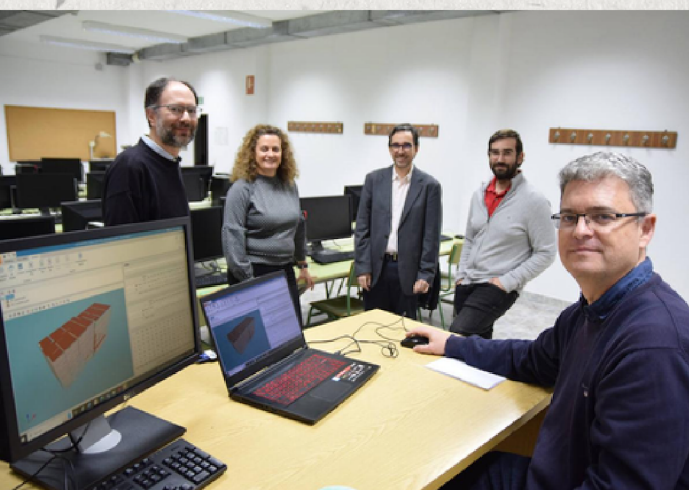
Project coordinator team